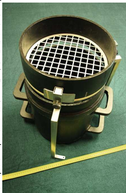
PIC.2 Working position

ing position, the cylinder in the kit can be used as a container for samples. The top of the cylinder can be closed with a lid. In the transporting position, the cylinder fits all of the primary equipment and accessories. Placing the kit in the transporting position is