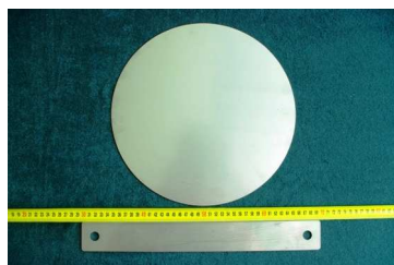
PIC.4 Lid and levelling knife