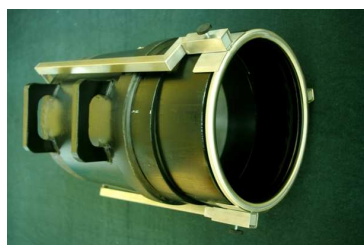
PIC. 1 Transporting position

The Compaqkit-1 is designed for determining the quantity of various bulk substances in accordance with EU standard EN12580. EN12580 provides the method for determining a quantity of growing mixes and soil improvers (horticultural peat, substrates, potting soils, compost, tree bark, etc.). The measuring kit has been manufactured in accordance with the dimensions set in EN12580. The measuring cylinder included in the kit has been calibrated, which is proven by the sticker on the measure and the calibration certificate included in the kit. The kit has transporting and working positions (see Pic. 1 and 2). To place the kit in the working position and vice versa takes a couple of minutes. In the transporting position, the kit takes up little space and is easily transported. In the transporting