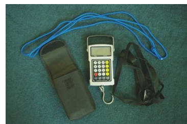
PIC. 5 Digital hang scale

Components in the main kit are listed in Table 1. The kit includes 2 spare bolts with plastic heads for fastening the legs of the precision stand. The brush with plastic bristles in the kit is the simplest implement for rendering pressed peat the way it was before being packaged. The brush allows peat to be manually milled off the surface of a pressed block and to release pressed peat particles from one another.